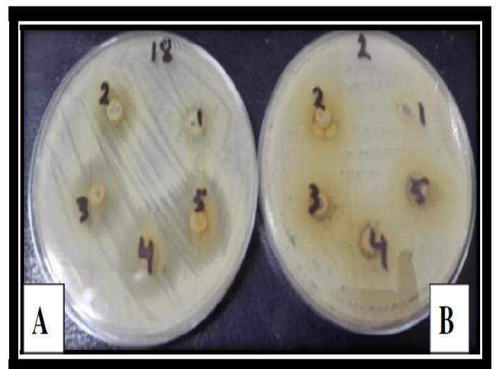
Fig. 1: Effect of aqueous extract of Citrus sinensis plant on A: Sphingobacterium Thalpophilum , B: Pseudomonas oryzihabitans

A= Pseudomonas oryzihabitans , B= Staphylococcus vitulinus , C= Sphingobacterium Thalpophilum , D= Klebsiella pneumoniae , E= Enterococcus faecium , F= Citrobacter freundii , G= Leuconostoc mesenteroides , H= Ochrobactrum anthropic , I= Chromobacterium violaceum , J= Escherichia coli