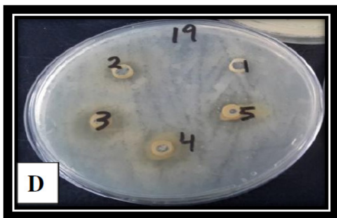
Fig. 3: Effect of methanol extract of Suaeda aegyptiaca plant on D: Klebsiella pneumoniae